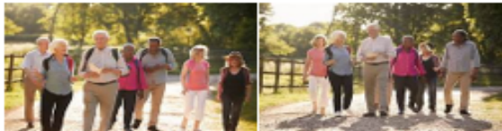
Fancy some Fresh Air in Good Company

This group meets once a month at various locations to have a leisurely stroll around a place of interest or along a Seafront and then finish with Coffee and Cake/Lunch at or near the location.