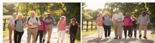
Fancy some Fresh Air in Good Company

This group meets once a month at various locations to have a leisurely stroll around a place of interest or along a Seafront and then finish with Coffee and Cake/Lunch at or near the location.