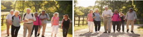
Fancy some Fresh Air in Good Company

This group meets once a month at various locations to have a leisurely stroll around a place of interest or along a Seafront and then finish with Coffee and Cake/Lunch at or near the location.