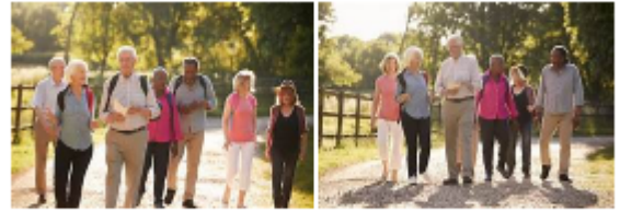
Fancy some Fresh Air in Good Company

This group meets once a month at various locations to have a leisurely stroll around a place of interest or along a Seafront and then finish with Coffee and Cake/Lunch at or near the location.