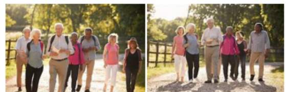
Fancy some Fresh Air in Good Company

This group meets once a month at various locations to have a leisurely stroll around a place of interest or along a Seafront and then finish with Coffee and Cake/Lunch at or near the location.